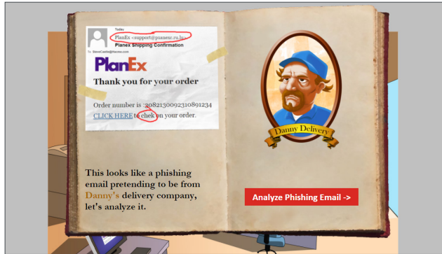
Engage users with a selection of interactive training modules

Over 60 interactive training modules will educate users about specific threats, such as suspicious emails, credential harvesting, password strength, and regulatory compliance. Available in a choice of 10 languages, your end users will find them informative and engaging, while you'll enjoy peace of mind when it comes to future real-world attacks: